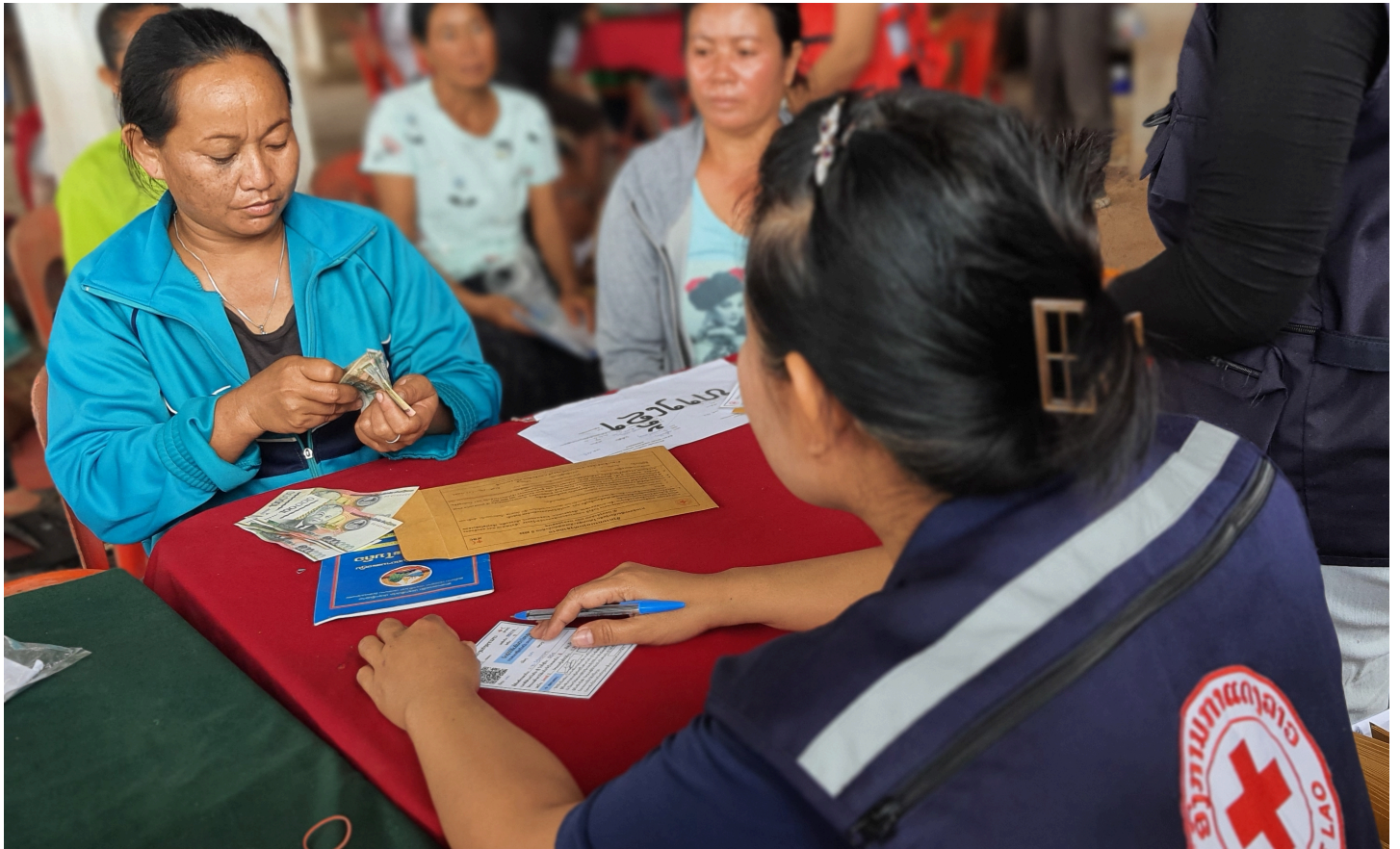
Affected population receiving cash assistance in Khammouan Province.