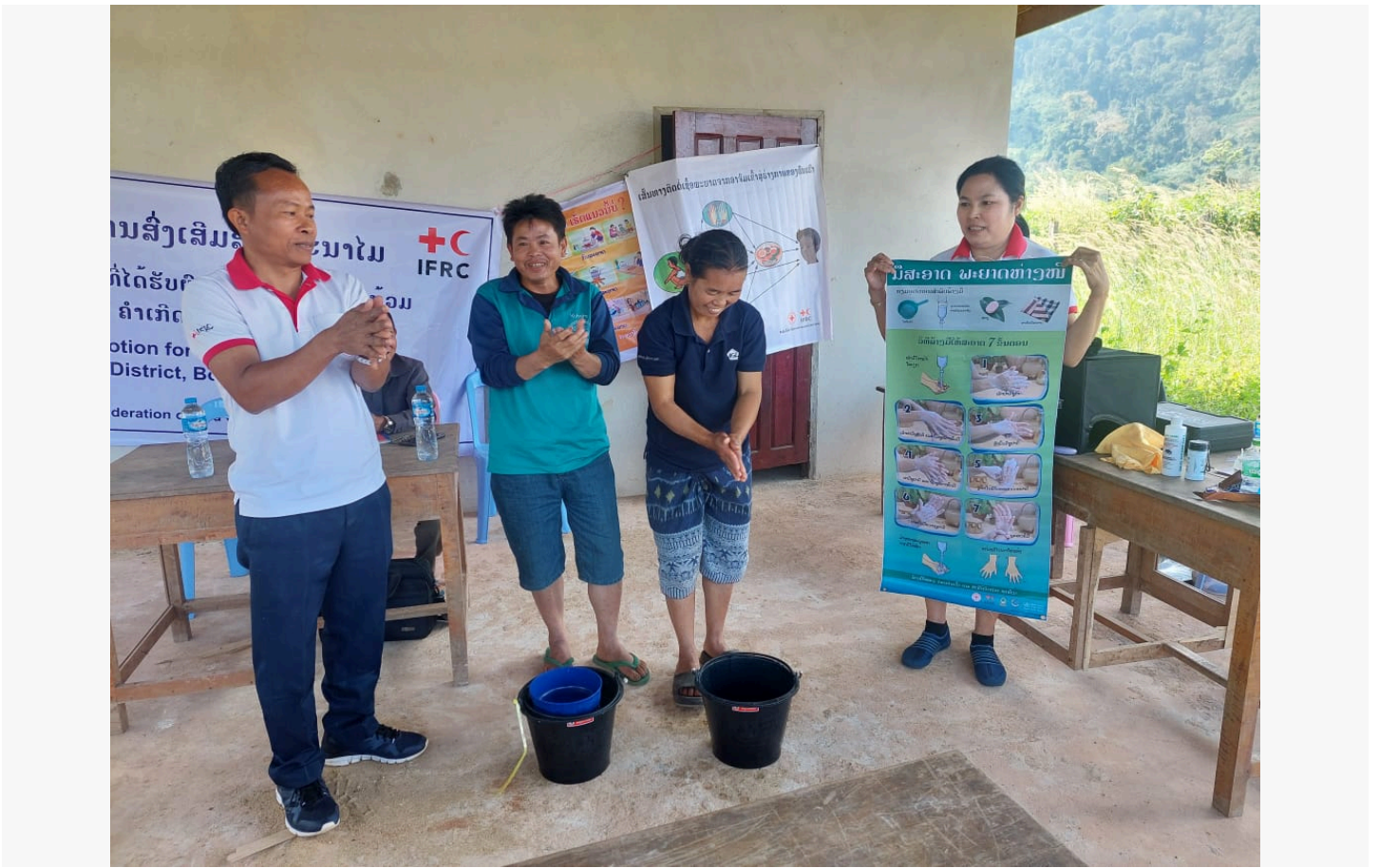
Affected population receiving hygiene promotion at Khamkert Village, Bolikhamxay Province