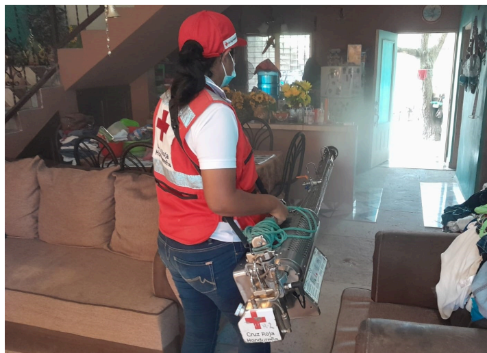
Volunteer supporting one of the house-to-house fumigation days.