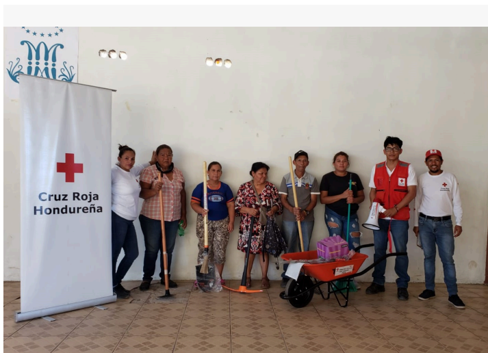
Delivery of tool kits to community leaders.

In that context, SESAL requested the Honduran Red Cross to not only continue joint actions, but also to extend interventions to more affected families in Comayagua. Responding to this demand, the National Society requested a one-month extension of the implementation time, without incurring additional costs, to cover more families in the affected areas through this IFRC-DREF.