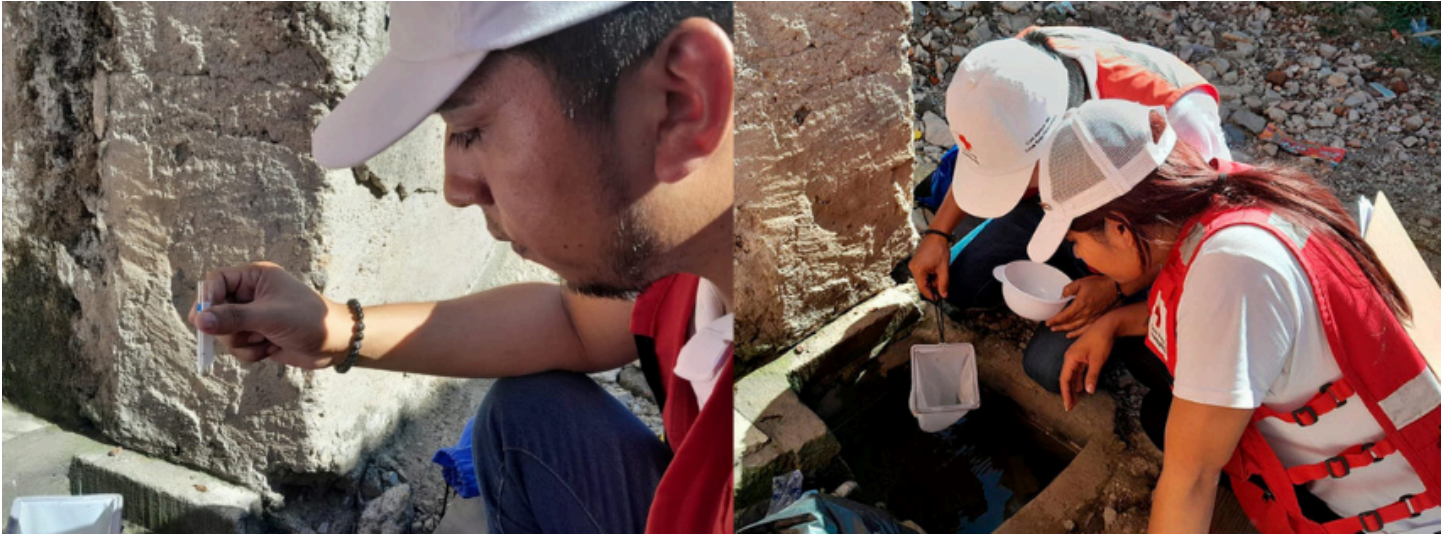
Larvae index survey days.