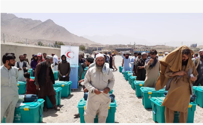
Supported by IFRC, ARCS distributed shelter kits to targeted households across Badakhshan, Kabul, Kandahar, and Maidan Wardak provinces.