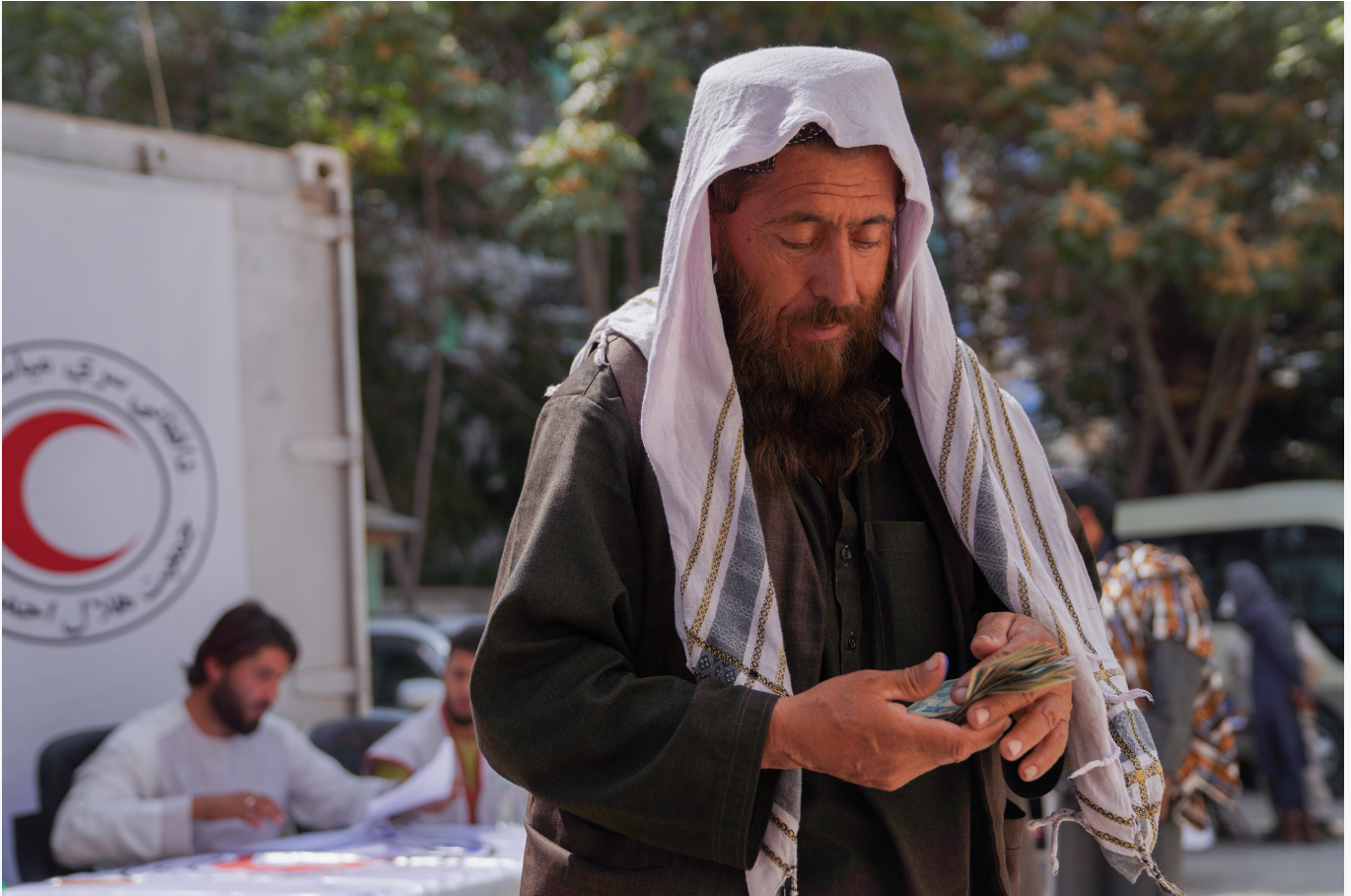
ARCS provided cash assistance to 2,000 flood-affected households across six provinces, to meet their emergency needs.