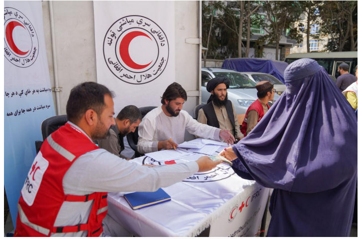
ARCS, supported by IFRC, delivered one-time multi-purpose cash assistance to targeted households across six targeted provinces.