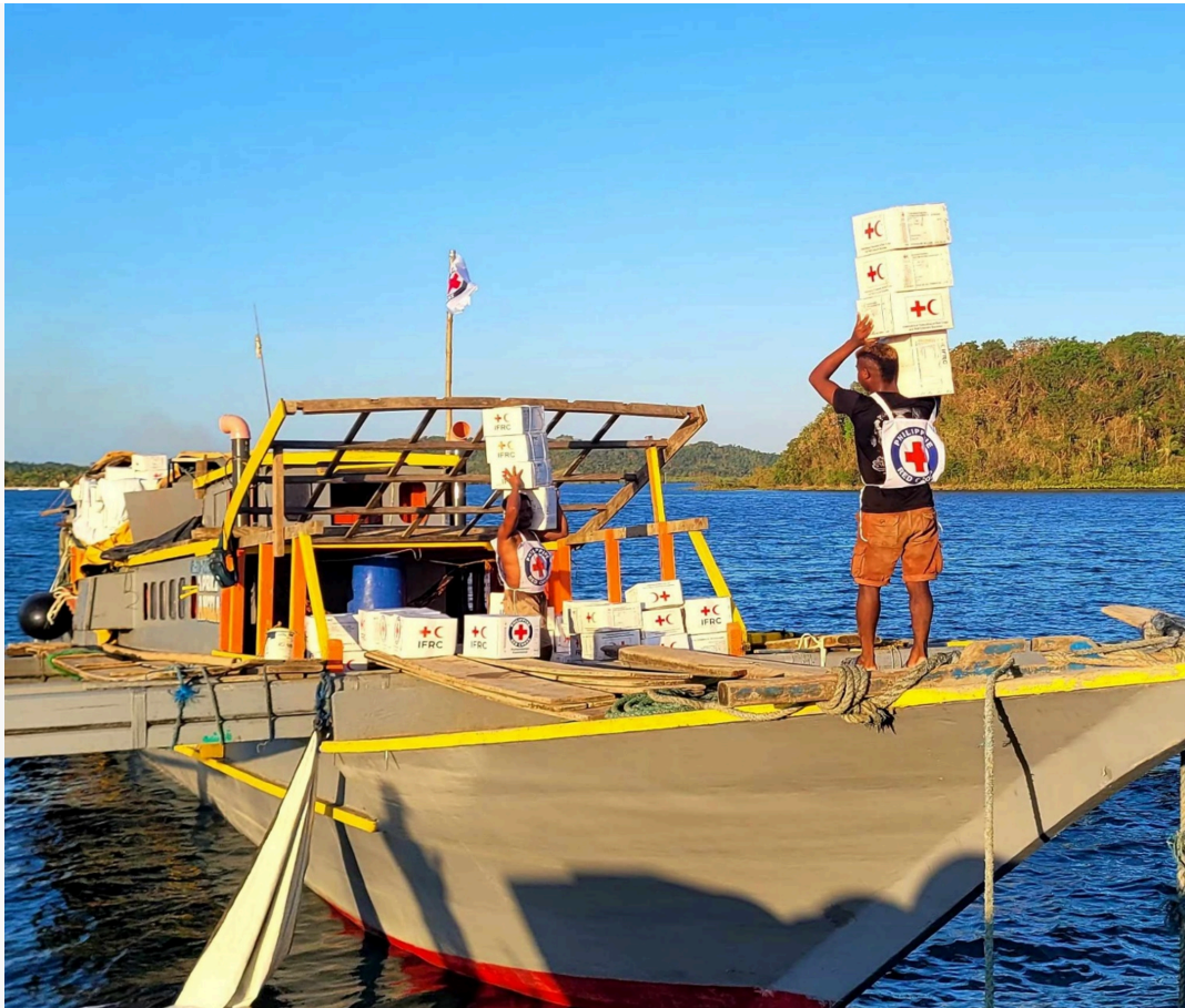
PRC targets far-flung and remote island communities for assistance, dedicated volunteers loading relief items for those affected by Typhoon Egay (Doksuri) in Cagayan.