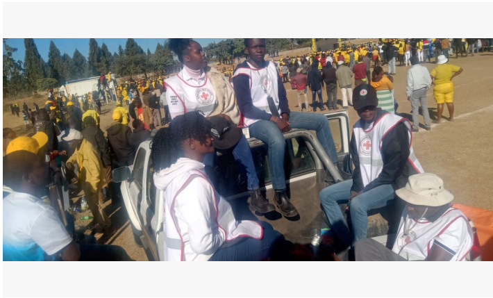
ZRCS Volunteers covering STAR rallies in Midlands Province