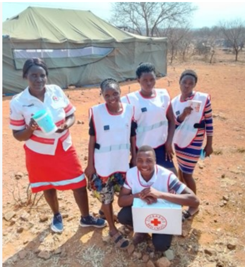
ZRCs Volunteers at one of the polling stations in Mberengwa district, 2023