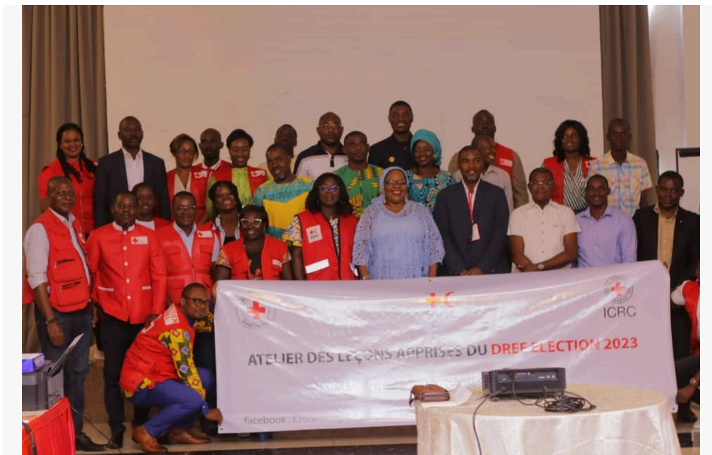
Lessons learnt Workshop attended by all the local Branches Ops coordinator and President/SGs, IFRC and ICRC staff