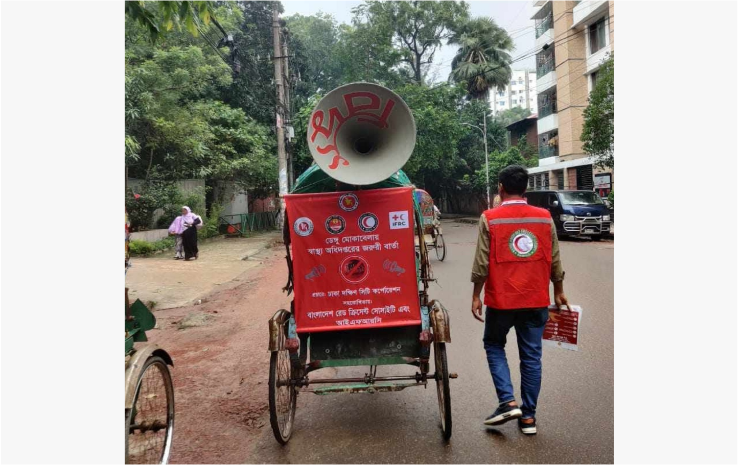
One of the trained BDRCS volunteers disseminating dengue awareness message through miking and distributing leaflets.