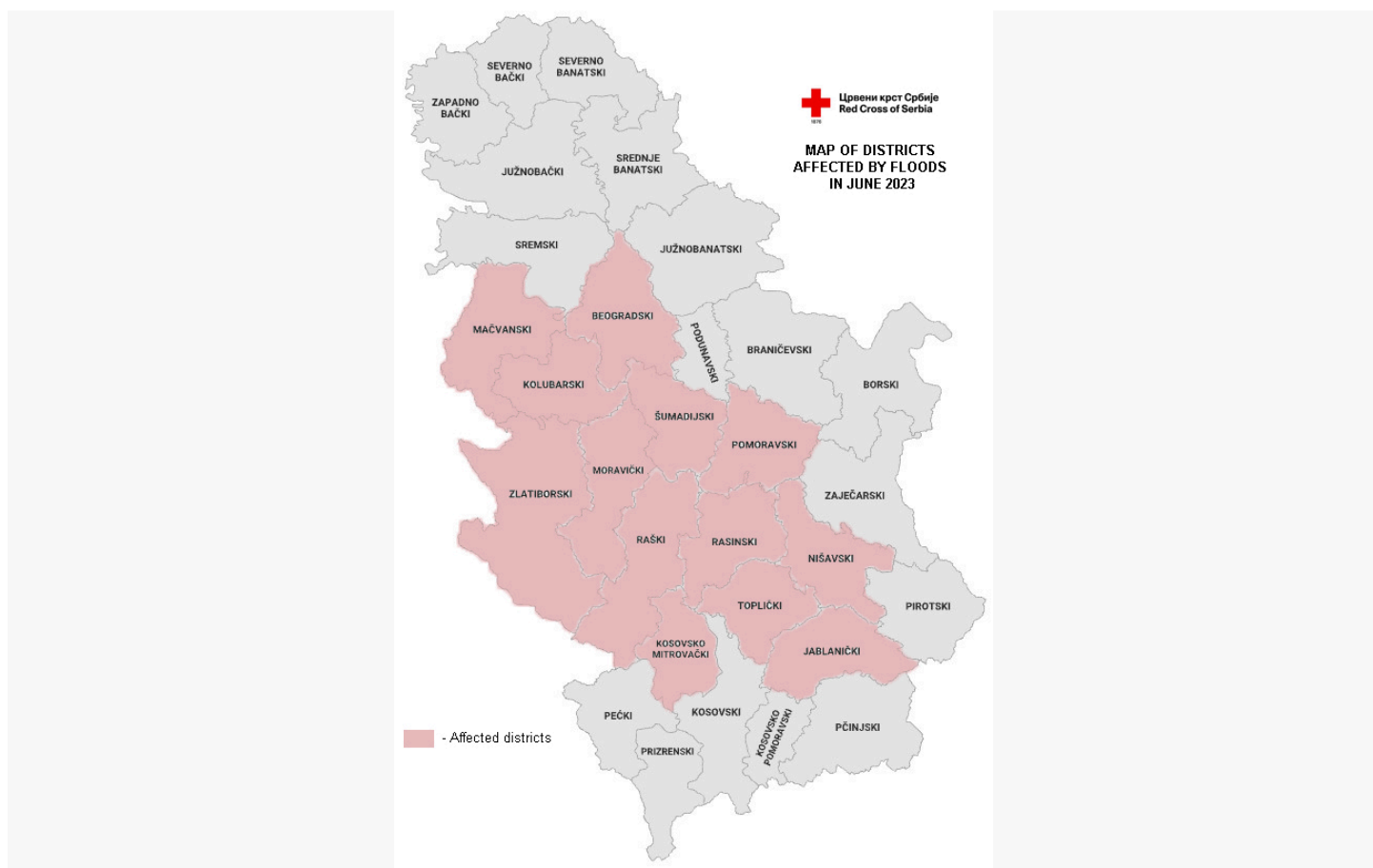
Map of districts affected by floods in Serbia, June 2023.