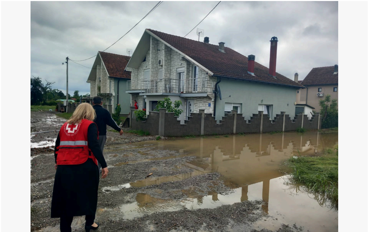
The Red Cross of Serbia (RCS) staff and volunteers responding to the floods in Loznica in June 2023.