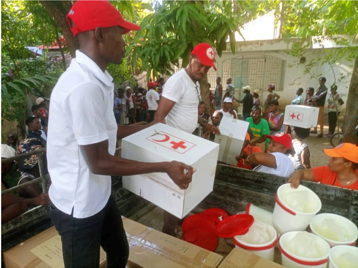
HRCS Volunteers and Staff work on distribution of Hygiene Kits in Leogane/October 2023.