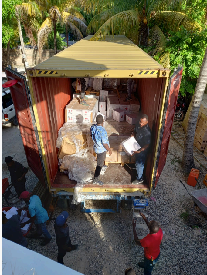
Unloading kitchen sets and hygiene kits at Swiss RC Base in Léogane.

time that this area has experienced an earthquake in a matter of days (there was a 4.1 earthquake on 4 June). The Grand'Anse department was one of the most affected during the 7.2 magnitude earthquake that affected more than 800,000 people in August 2021.