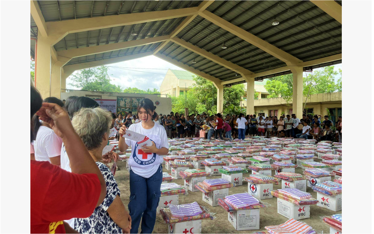
The Philippine Red Cross distributing essential household items and implementing intensified key health messages through the distribution of IEC materials to the communities in evacuation centers.