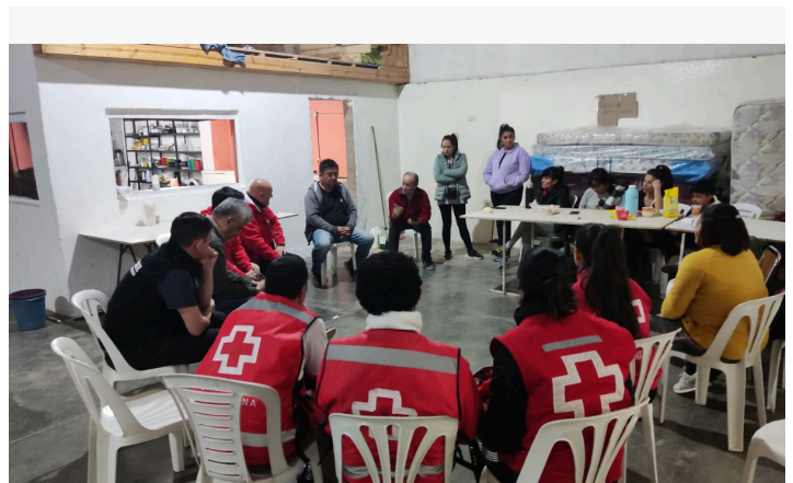
Community focus groups, Neuquén.