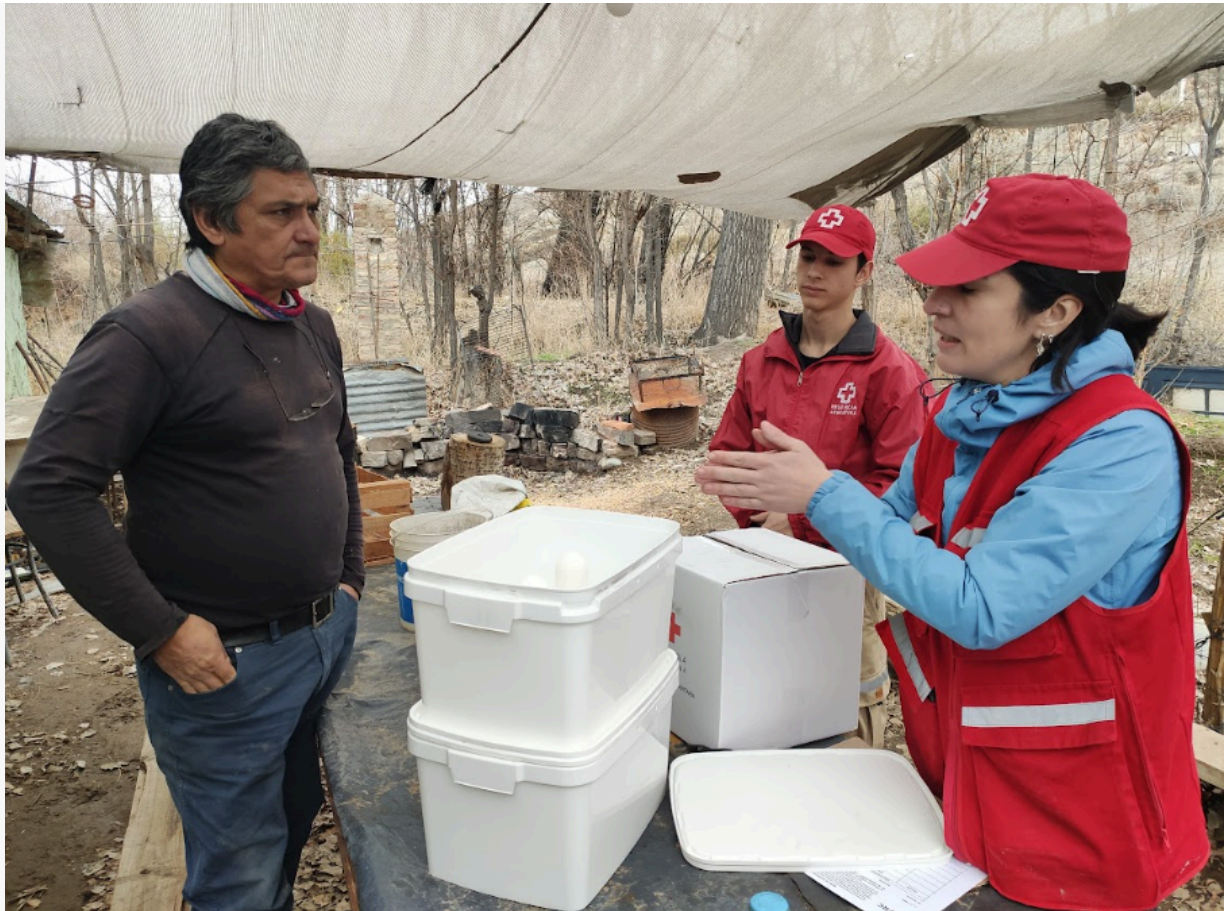
Delivery of humanitarian aid, Chos Malal.