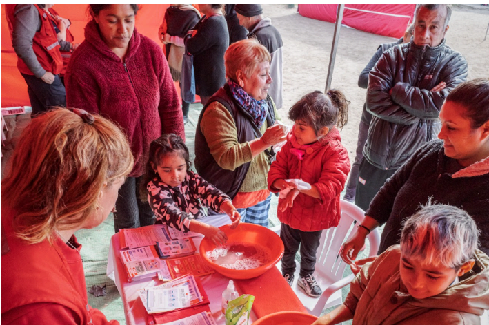
Hygiene Promotion Activities, Quilmes.

This scenario was also aggravated by the seasonal meteorological conditions typical of the Patagonian region, characterized by strong and cold winds during winter. This is especially noticeable in the mountain range and pre-mountain range, where the dry climate and low temperatures, with freezing averages for much of the year and precipitation in the form of rain, sleet, or snow.