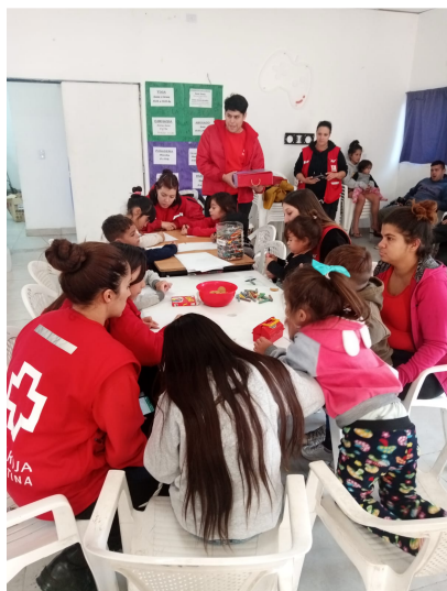
PSS activities in shelter.

In some areas near the streams, irregular waste disposal sites have been identified. As a result, due to flooding, these wastes have been dragged into the interior of houses. In addition, this situation hindered the proper drainage of drains and sewers, which deepened the impact of the flooding on the population.