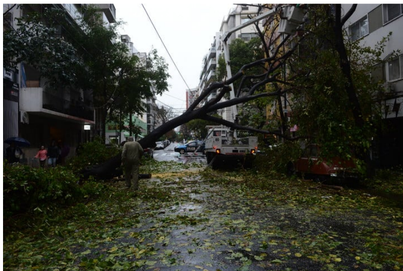
Falling trees interrupted traffic and basic services.