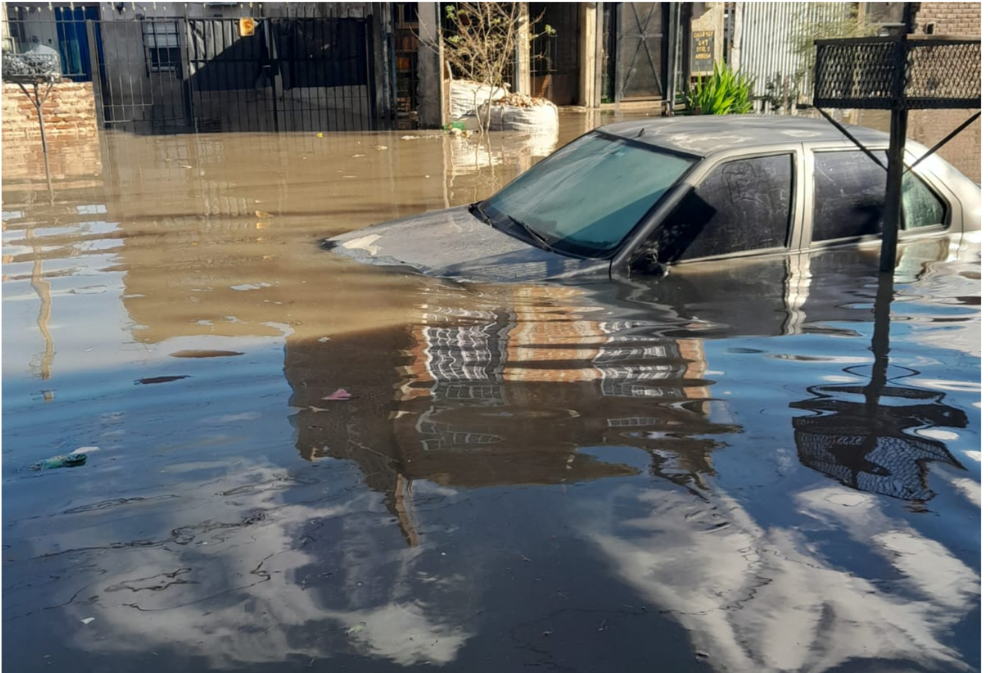
Flooding in the municipality of Quilmes, Province of Buenos Aires, Argentina. 26 May 2023.