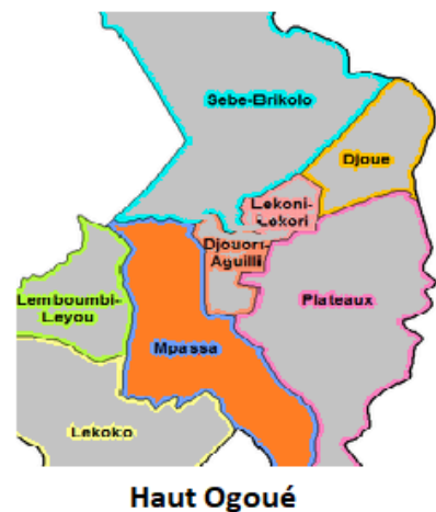
Map of affected province.