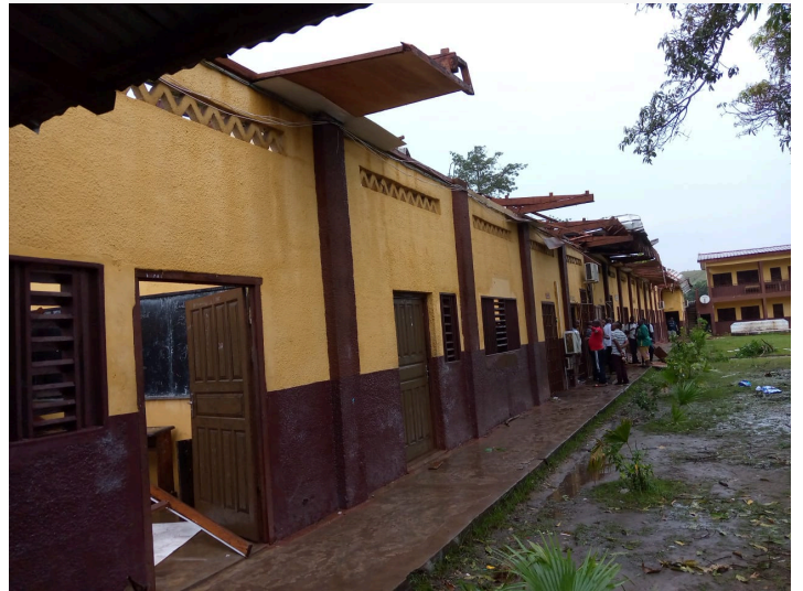
Quartier St Hilaire. Roof of the Lycée Monseigneur Jeean Jérôme Adam, completely destroyed