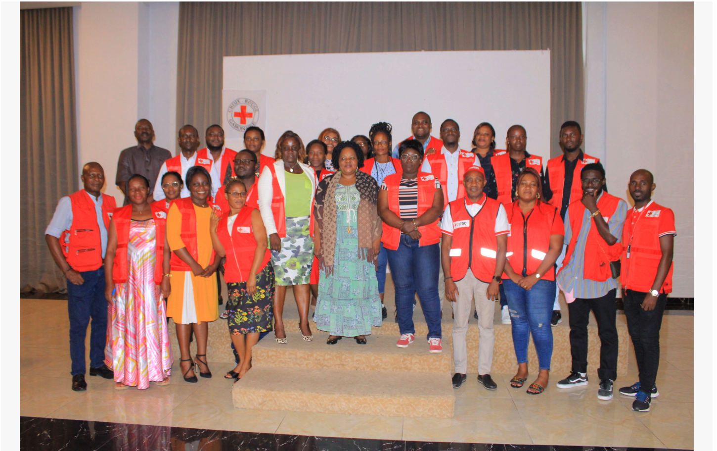
Lessons Learned Workshop