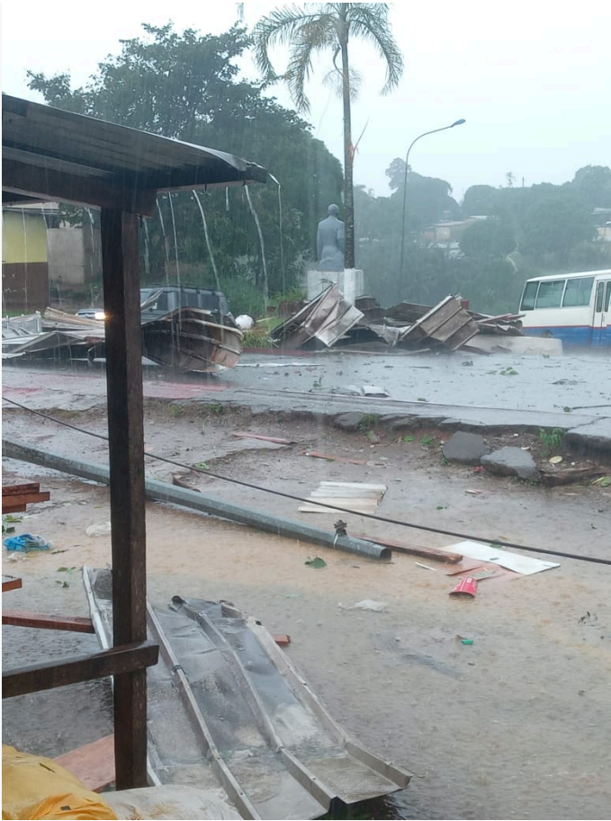
Magoungou district. Sheet metal of a house completely destroyed and blown away at the Eugène Marcel Amogho crossroads.