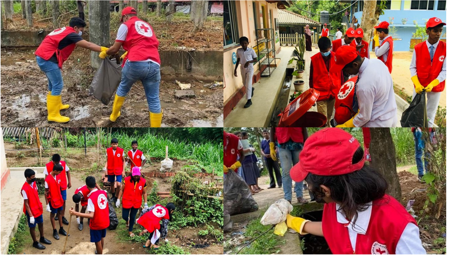
SLRCS volunteers are actively engaging in Dengue clean-up activities.