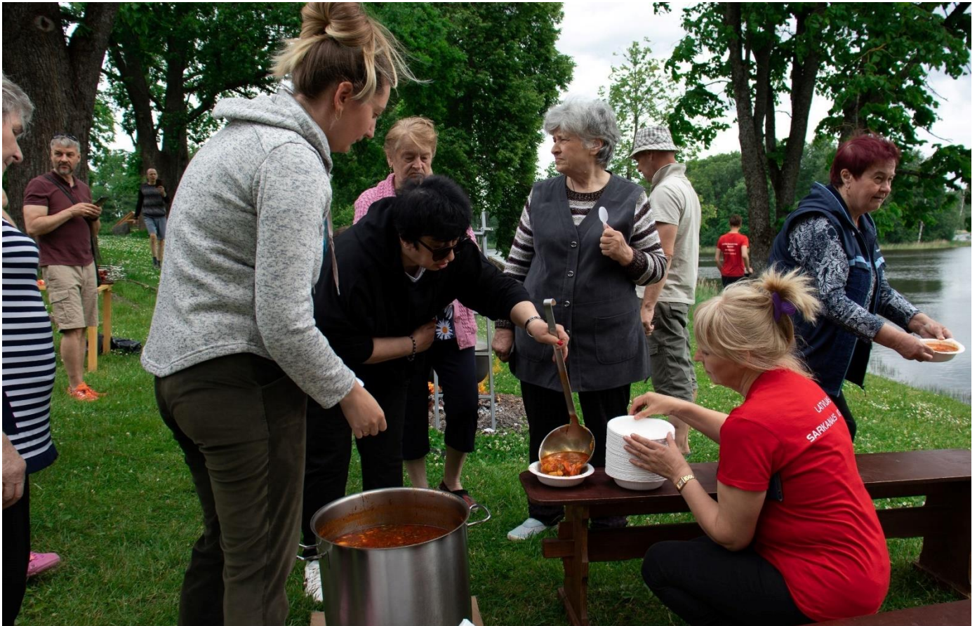
Latvian Red Cross volunteers with displaced people from Ukraine prepare borscht in Adamova, Rezekne region, Latvia on summer 2023.