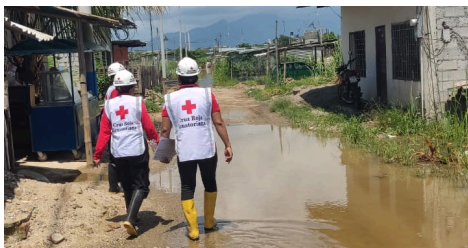
Needs Assessment. April, 2023.