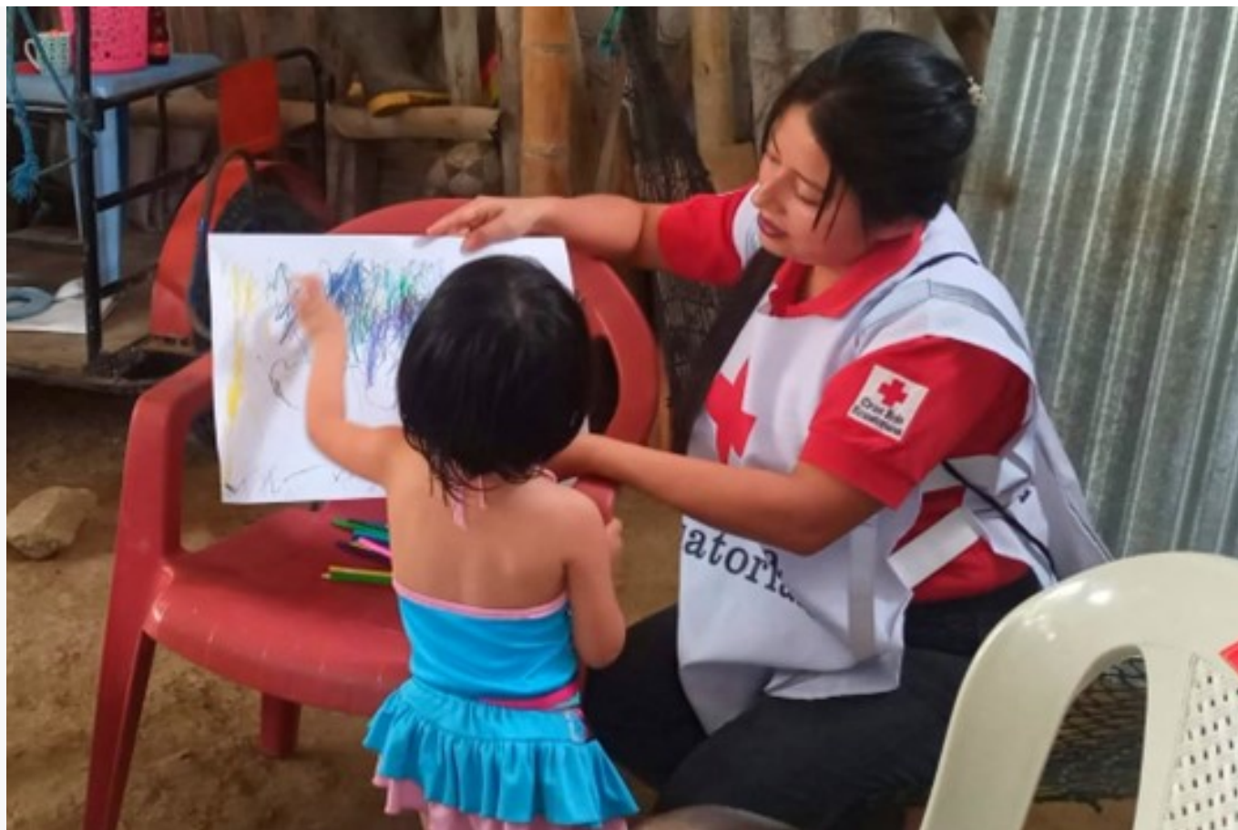
Community work. Manabi, Agosto 2023.