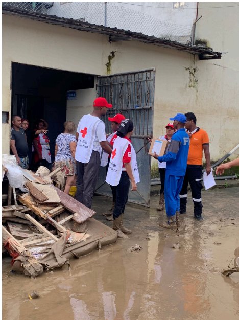
ERC responding to Floods. June 2023.

To respond to this combined emergency and based on the results of the IFRC-DREF for Assessment, the National Society launched an Operations Update in March 2023 to provide support to families affected by the earthquake and floods.