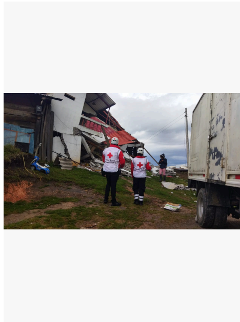
ERC responding to earthquake. March 2023.