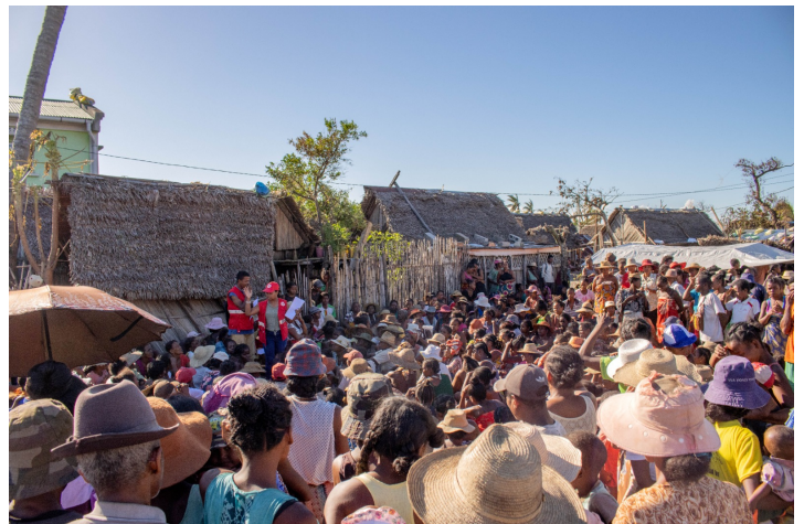
Sensitization session and setting up of RCCE committees ahead of the landfall of cyclone Freddy (District of Mananjary, Feb 2023)