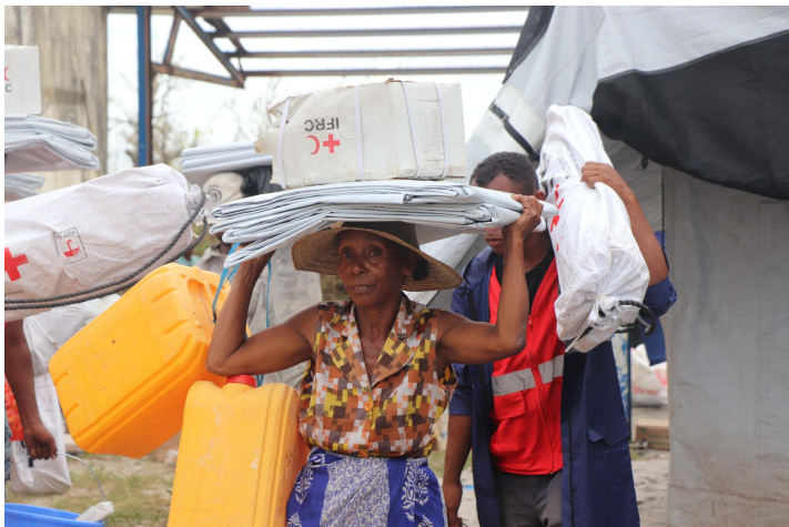
member of communities benefiting from essential kits after the landfall of cyclone Freddy (District of Mananjary, March 2023)

After bringing heavy rains and winds to the islands of Mauritius and La Réunion, Tropical Cyclone Freddy made landfall on the east coast of Madagascar on 21 February 2023 at around 19:00 (local time). Tropical Cyclone Freddy weakened from a Category 4 cyclone to a Category 3 cyclone before making landfall, but hit Madagascar with sustained winds of 150km/h. It made landfall in the north of Mananjary, an area previously hit by two tropical cyclones in February 2022 (Batsirai and Eminat) and by the previous cyclone, Cheneso, a few weeks earlier (January 2023).