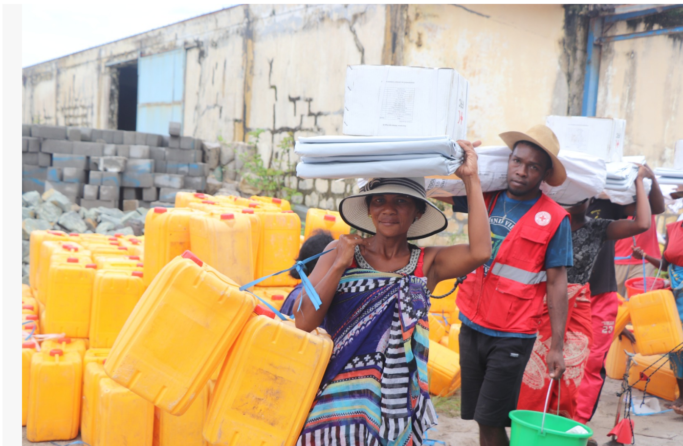
Distribution of essential kits to communities affected by the cyclone Freddy