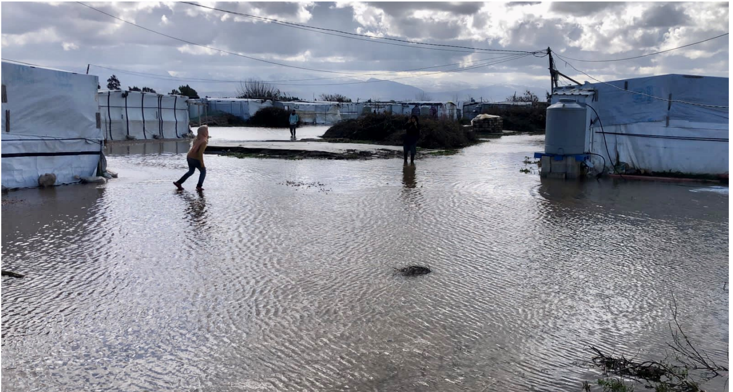
Syrian refugees navigate freezing floodwaters in an informal tented settlement in Lebanon's Akkar governorate.