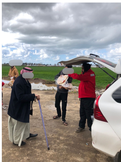
Lebanese Red Cross volunteers distribute bread in one of the informal tented settlements in Akkar governorate.

This comes as Lebanon is attempting to recover from a cholera outbreak in late 2022 and is grappling with severe strain on its healthcare system due to a socioeconomic crisis prevailing in the country since late 2019.