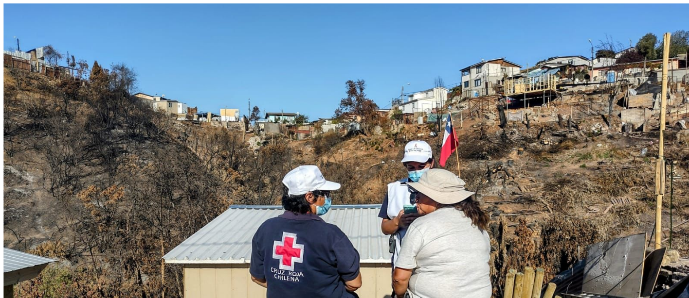
Survey of affected families - Trenque Sur, Viña del Mar - January 2023.