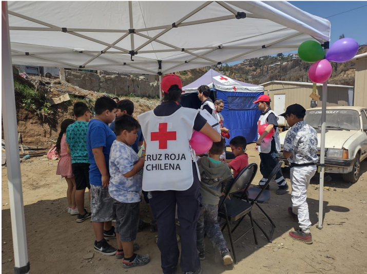
PSS activities for children - Viña del Mar.

According to the National System for Disaster Prevention, Mitigation and Attention (SENAPRED), in December 2022, a total of 2,455 people (491 families) were affected, 371 houses were completely destroyed, 312 people were injured and 2 died due to the fires in Viña del Mar. Affected families lost the entire structure of their houses, but also basic subsistence items and animals. The forest fires also caused significant damage to the flora after the burning of the Chilean Palm, a species native to the Valparaíso Region.