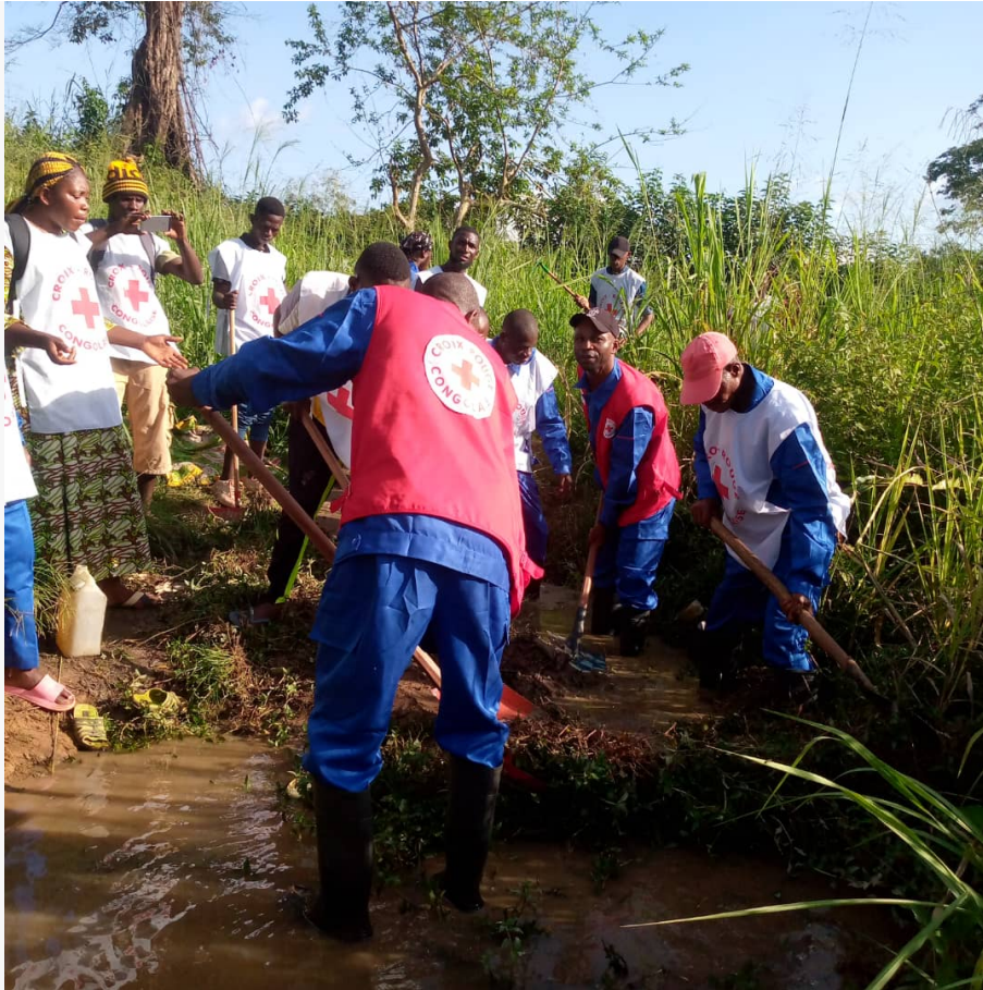
Red Cross volunteers working to restore a plot of land after floods