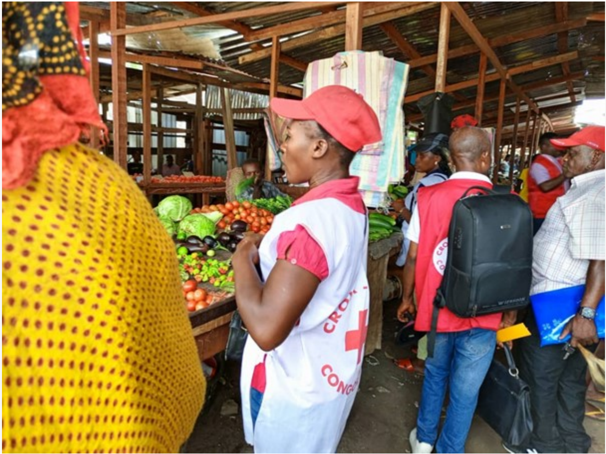
Data collection for market analysis in Ouessou city