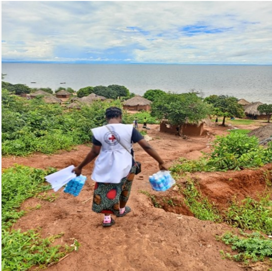
Red Cross volunteer on the way to distribute Chlorine in Msumbu District