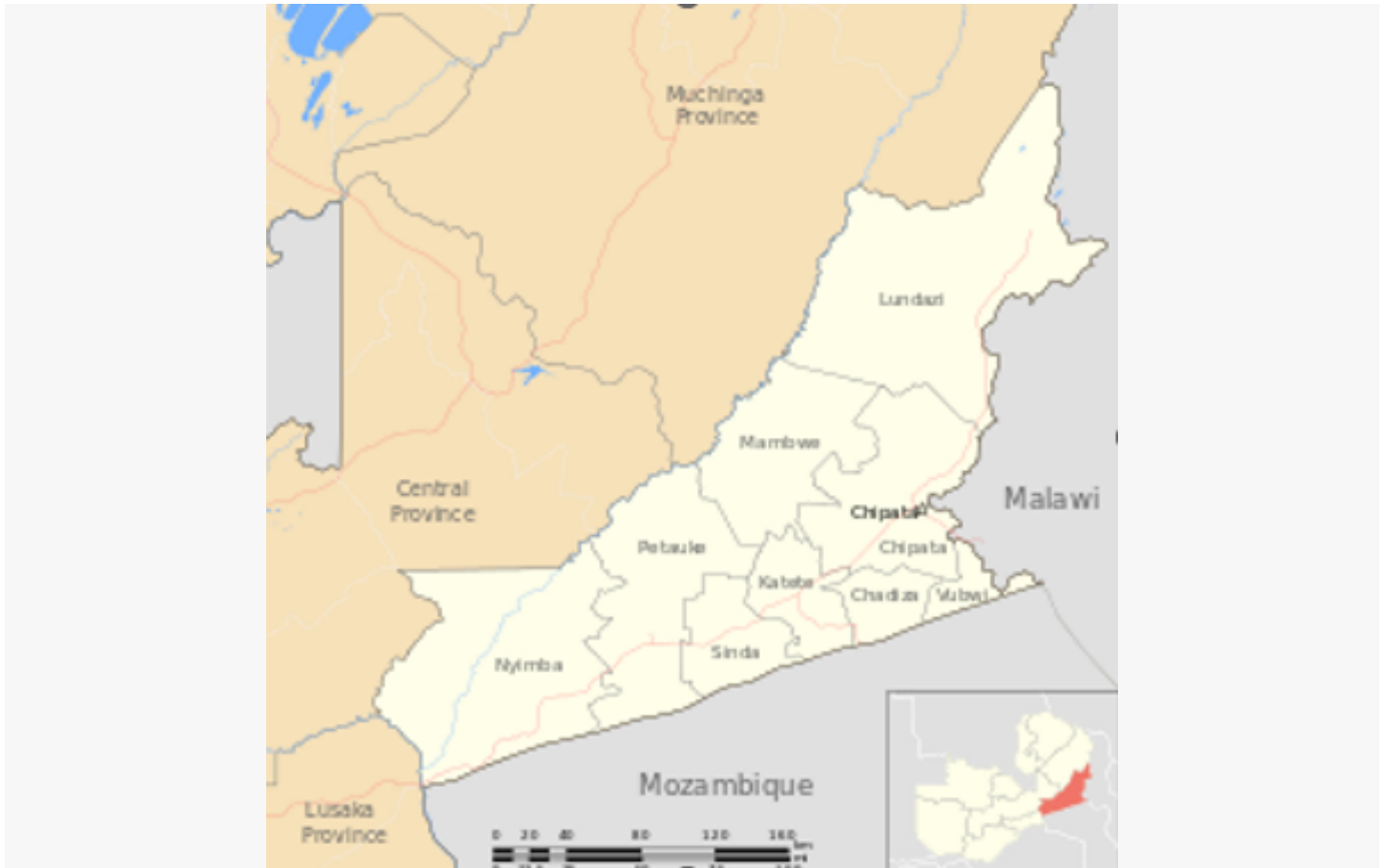
Map Eastern province Zambia