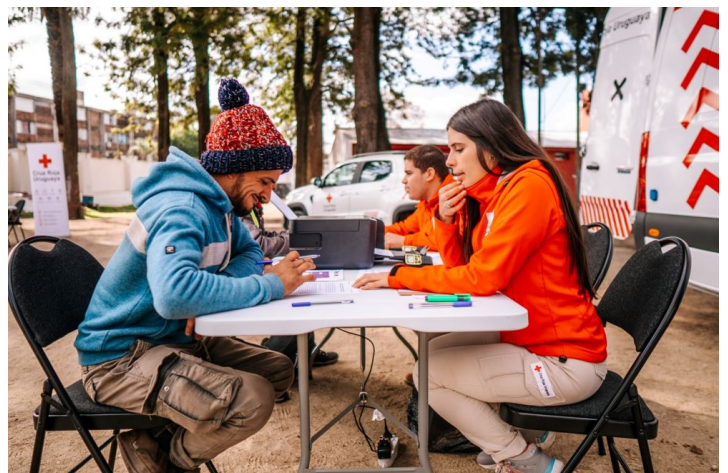
CVA distribution of preloaded cards, Florida - Source: Uruguayan Red Cross.