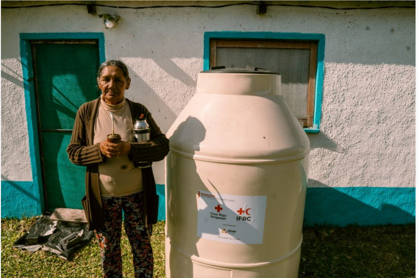
Distribution of water tanks in Tacuarembó - Source: Uruguayan Red Cross.