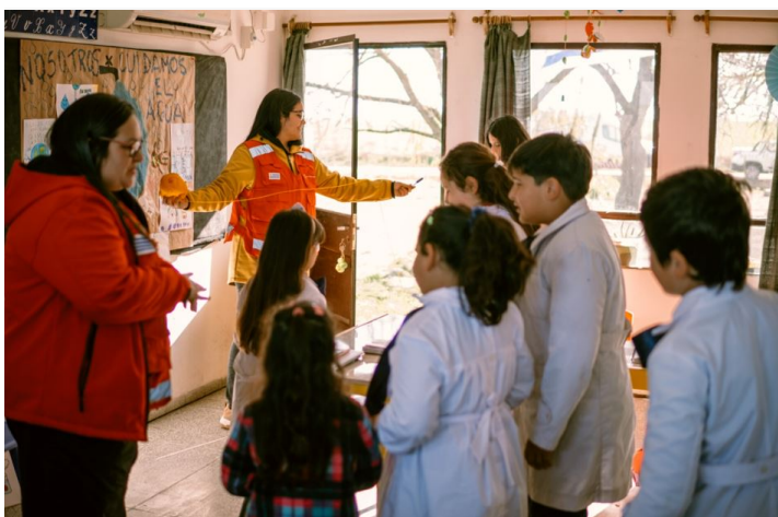
WASH sensitization in rural school in San Jose - Source: Uruguayan Red Cross.

(3) Severino Pass Reserve: https://www.elobservador.com.uy/nota/sirvio-la-lluvia-subieron-levemente-las-reservas-de-paso-severino-202377181656