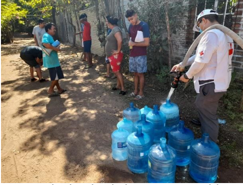
Water distribution in in the communities of Jiquilisco, December 2022.

The distribution of 200 water filters is planned for the fourth week of January 2023. This is expected to assist 1,000 people (200 families).