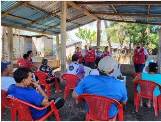
Meeting with community leaders from Icaco, Narvaes, Limon and La Cañada communities, to inform them of the complete process of the cash delivery programme. 22 November 2022.