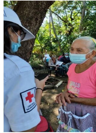
Participation of people in pre-distribution perception surveys in the communities of Puerto Parada, prior to cash delivery, December 2022.

A meeting was also held with Catholic Relief Service (CRS), who had previously delivered cash to several communities, some of them intervened by the Salvadoran Red Cross (SCR) through these DREF funds. However, after several internal analyses, it was decided that it was not necessary to replace the communities, but that it was necessary to continue supporting them because the money previously received from CRS did not cover the basic food basket, so the contribution from the Salvadorean Red Cross will contribute to complement it.