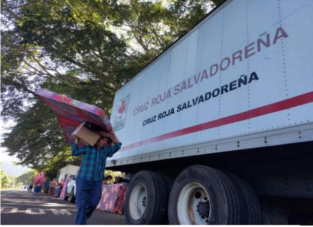
Distribution of shelter supplies by Salvadoran Red Cross to people affected by TS Lisa.

During and after the emergency, 843 mats were delivered, assisting 1,416 people . Also, 1,325 blankets were delivered, assisting 387 families .