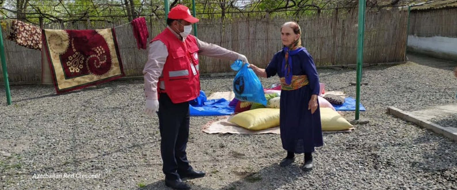
Azerbaijan Red Crescent