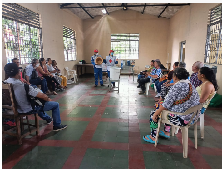
Awareness raising sessions in Huila, April 2023.