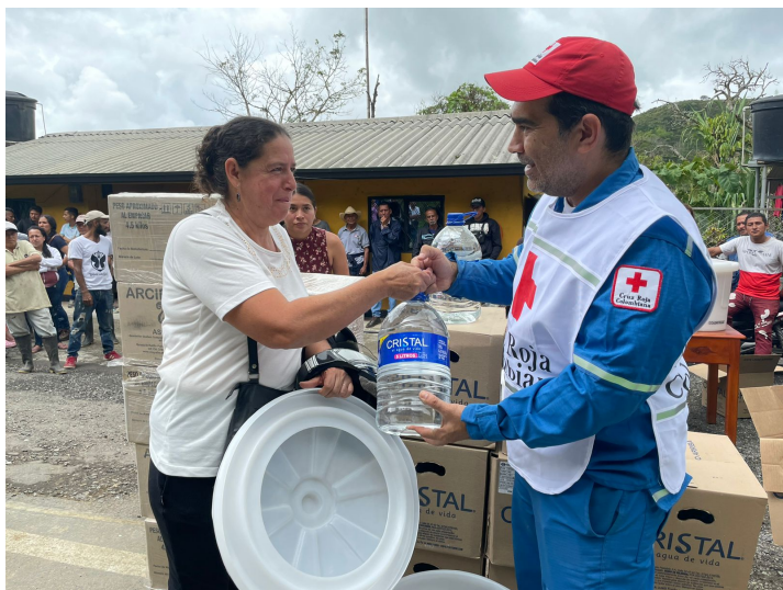
Communities receiving humanitarian aid in Cauca, February 2023.

https://www.funcionpublica.gov.co/eva/gestornormativo/norma.php?i=197544