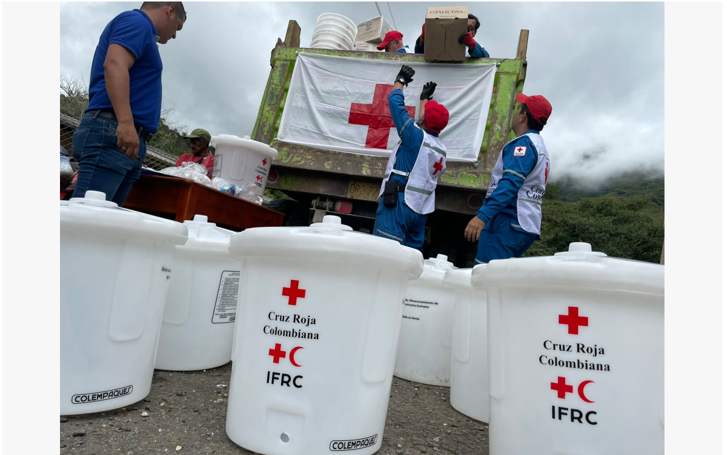
Colombian Red Cross Society providing assistance in Cauca.