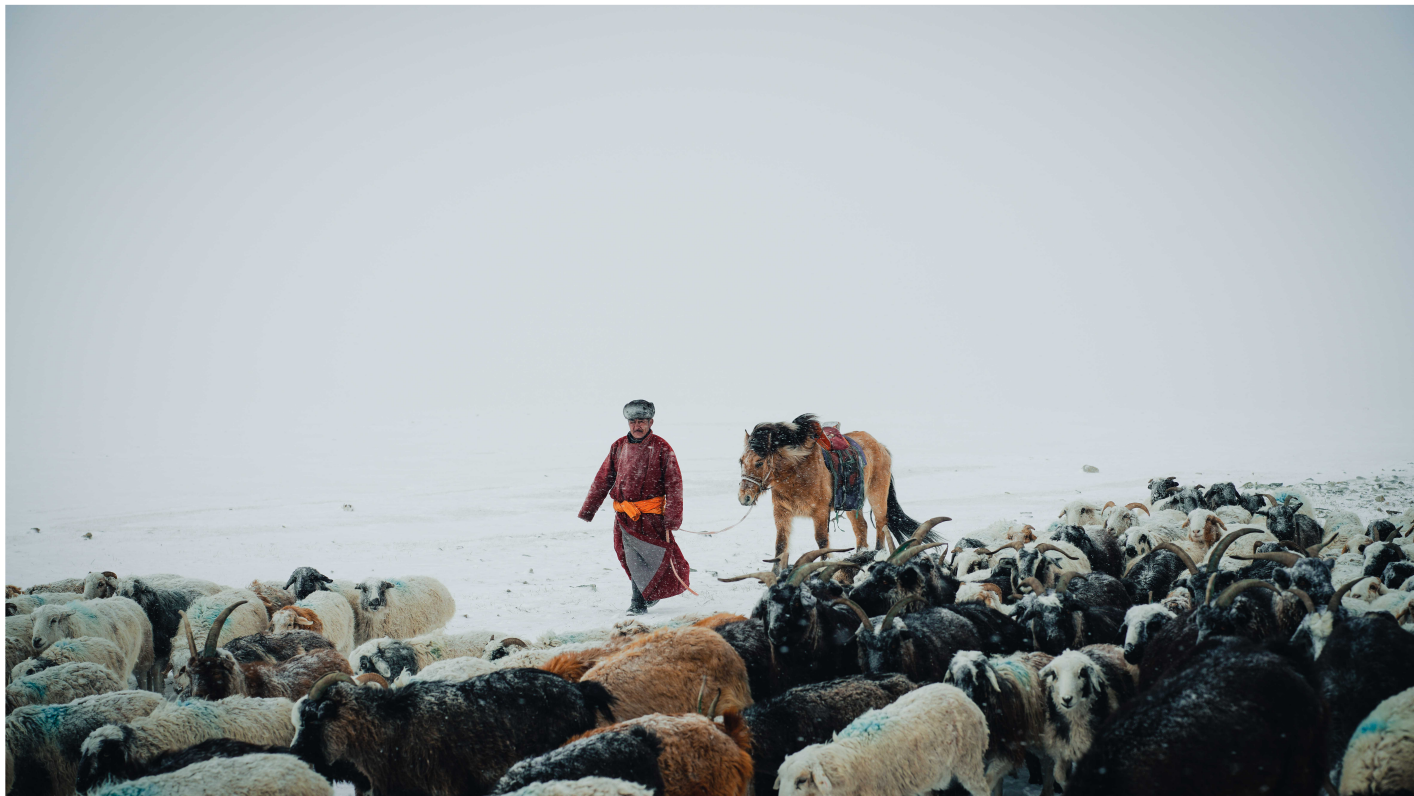
Herder migrates with herd for better pasture in Arkhangai province