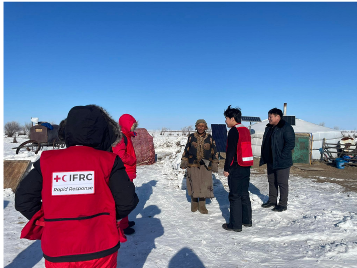
IFRC and MRCS's joint assessment team visits herder household in Dornod province.