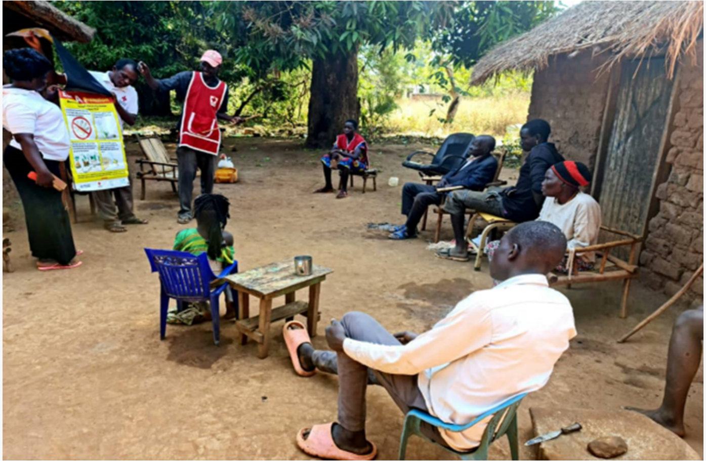
Volunteers conducting EVD awareness in Yambio county photo on 12th December 2022