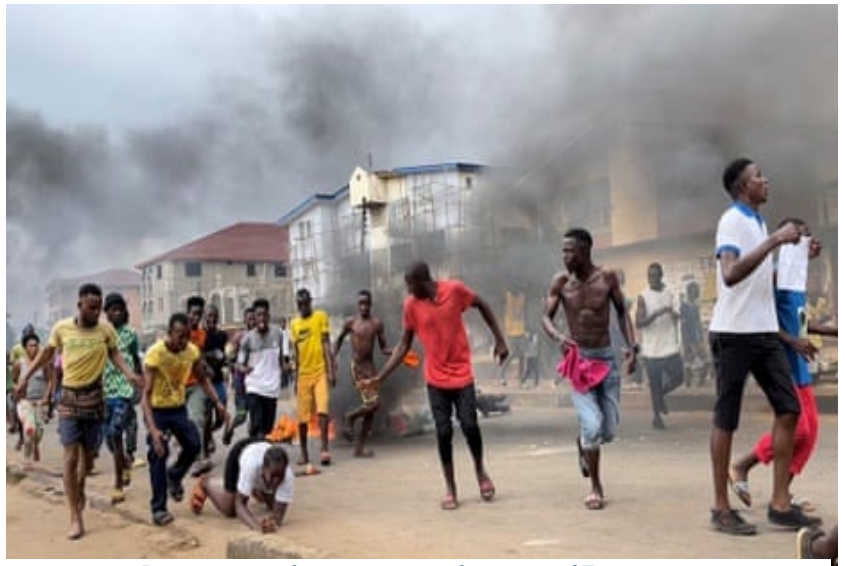
Demonstration by protesters on the streets of Freetown

On 13 August, with the severity of the situation, the Vice President of the Republic declared a state of emergency and imposed a nationwide curfew from 3pm to 7am that day, which was later reviewed to take place from 7pm to 7am due to severe internal commotion. Main reported incidents by then include: