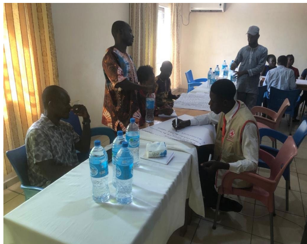
Group work during lessons learnt