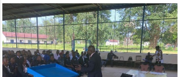
Training of police officers