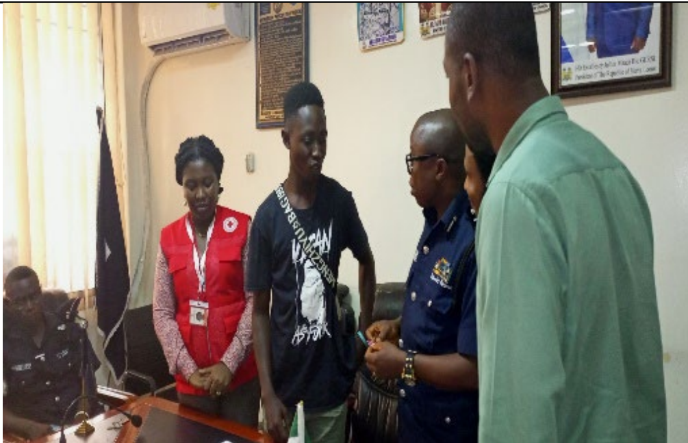
Presentation of sim to a relative of a dead victim of the Civil Unrest