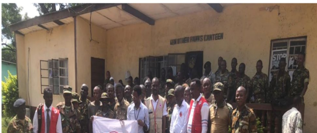
Training of military officers

Participation of the affected communities was prioritized, and a particular attention was put on the feedback received from volunteers' visits or during the distribution and PDM.