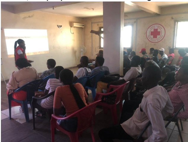
Orientation of volunteers on first aid

In total, 150 people were reached through our first aid intervention.