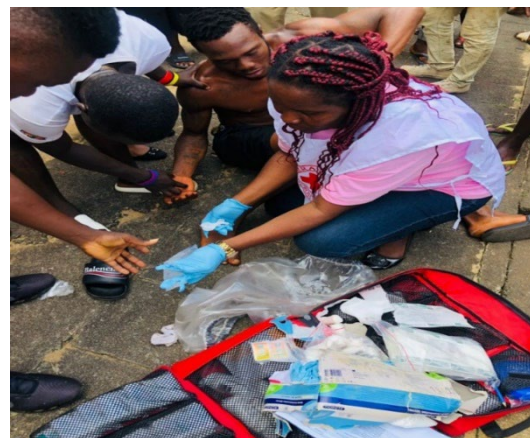
Red Cross Volunteers providing first aid.

Blood donation to hospitalized affected people: Following the demand from Health centers and communities, the NS promoted blood donation from volunteers. A total of 60 volunteers were mobilized and donated 60 units of safe blood for patients under treatment at secondary and tertiary facilities.