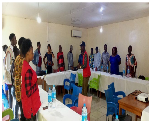
Civil Unrest lesson learnt workshop with stakeholders