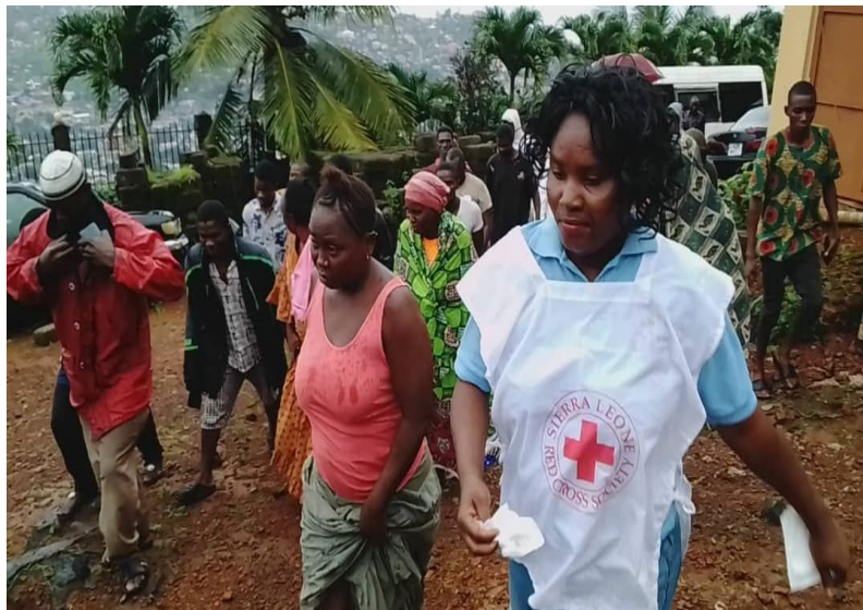
Western Area volunteers during a visit to affected homes for PSS.

PSS session: Community-based volunteers in Bombali, Port Loko, Kambia, and Koinadugu held PSS sessions targeting homes of known affected victims, especially those that lost their loved ones, and others whose homes and business were destroyed, and also those who were injured and admitted. Prior their PSS session, orientation session was held for volunteers on psychological first aid, teaching about normal reactions to stressful events, and coping mechanisms. Monitoring visits and one-on-one engagements with victims show action of volunteers facilitated and promoted resilience within individuals, families, and communities enabling them to be actively engaged in the process of recovery. In total, 08 PSS sessions were held in each of the hotspot locations, reaching out 1,519 people as indicated below: