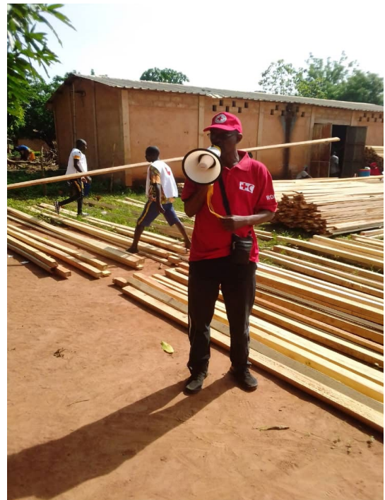
Distribution of construction kits

The performance of this intervention is linked to the anticipation of several risk continuously assessed and mitigate by CARRCS. The most important being: