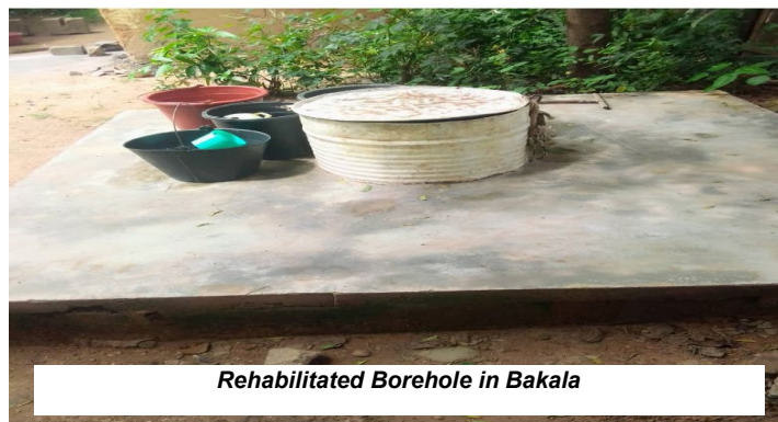
Rehabilitated Borehole in Bakala

Access to water and wash activities are underway. Changes due to reality in the affected areas are still not registered. More than 250 affected households are in need of latrines, but the current DREF budget has allowed for only 100 latrines. Advocacy with other partners was done to cover the gap as the support provided was not enough across the communities that have existing vulnerabilities before the fire.