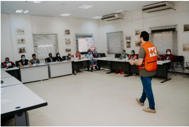
Figure 6: IFRC trainer providing training content to ERC volunteers.