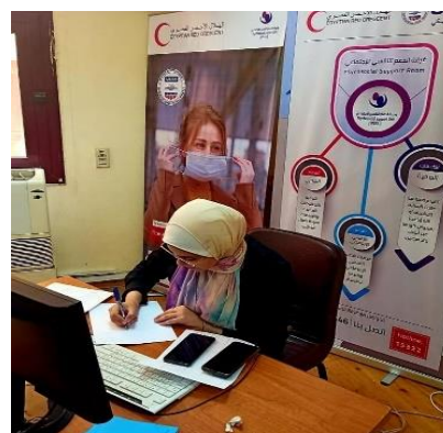
Figure 4: ERC volunteers providing psychological support and evaluation to affected people.

With IFRC support, the ERC and IFRC regional delegation conducted a Psychosocial Support in Emergency training for ERC volunteers in the affected branches. The training aimed to ensure the best possible short and long-term effects of mental health and psychosocial support (MHPSS) are being addressed, as implementation in such a context requires specialized knowledge of a number of disciplines within the field. The training covered all of the objectives associated with initiating well-structured mental health and psychosocial interventions during emergencies.