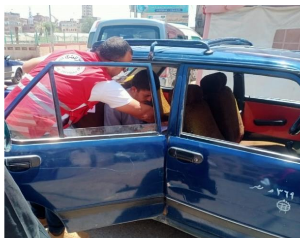
Figure 3: ERC volunteers distributing cash assistance to affected people with physical disability in their cars.

Through this operation, ERC provided multipurpose cash grant assistance of EGP 4,200 (CHF 125) per household to 122 families, including 27 people with disabilities and eight families who had lost their household heads.