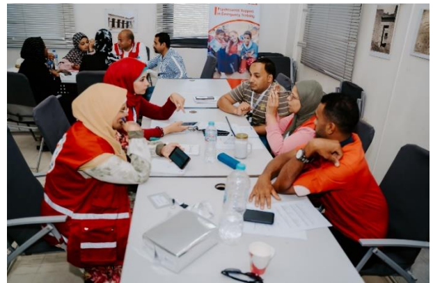
Figure 5: ERC volunteers in working group discussion.

Additionally, the IFRC facilitated a lesson learned and a CVA self-assessment workshop for ERC staff and volunteers. Staff and Heads of branches that implemented CVA activities participated in these workshops.