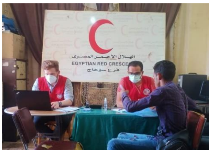
Figure 2: ERC volunteers distributing cash assistance to affected in people in nearest ERC branch.