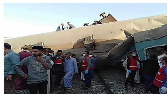
Figure 1: ERC team responding to crisis and transporting the injured people.

The Surveillance Cameras from the scene in the southern province of Sohag, 270 miles south of Cairo, taken shortly after the collision showed derailed cars turned into twisted piles of metal, with some passengers trapped inside. Bystanders carried bodies and laid them out on the ground near the site. Seventy-two ambulances were sent to