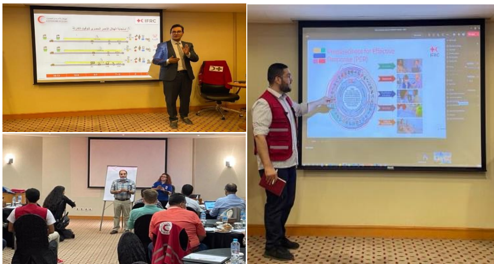
Figure 7: Lessons Learned Workshop facilitated by IFRC.

Additionally, the IFRC facilitated a lesson learned and a CVA self-assessment workshop for ERC staff and volunteers. Staff and Heads of branches that implemented CVA activities participated in these workshops.